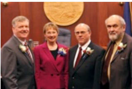
Senate Minority: Senator Huggins, Senator Giessel, Senator Coghill and Senator Dyson